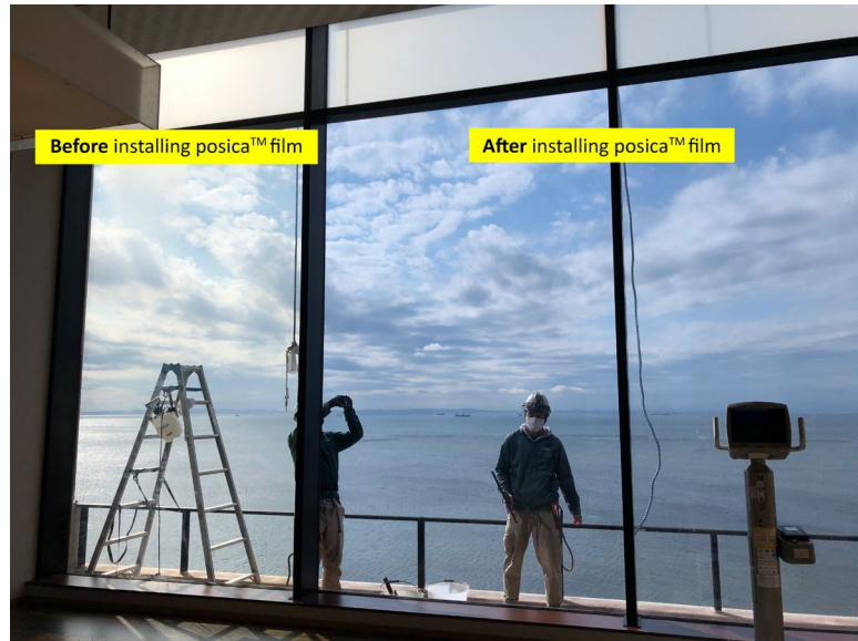
Image taken at Hotel Mikazuki. The colour of the sky and sea is sharper and less glaring.

In a small-scale trial at selected Japan office spaces, when posica™ was applied to the windows, it was also observed that the enhanced visuals and views helped workers to focus better at work.