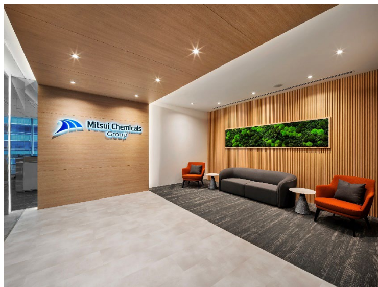
New office main entrance waiting area for guests

Mitsui Chemicals Asia Pacific (MCAP) – The Asia Pacific Regional HQ for Mitsui Chemicals Group in Singapore will be relocated to a new office in the month of January and is slated to be fully operational by 21 January 2024. The new office, located at Harbourfront Tower One, will be redesigned and fitted with enhanced facilities and amenities to better meet the modern business needs.