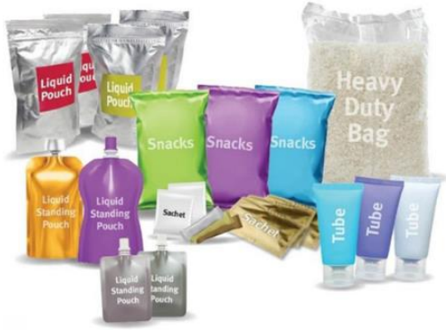
Examples of packaging made using Evolue™